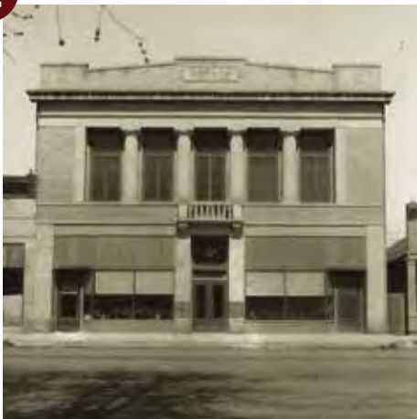
MASONIC TEMPLE 509-517 E MAIN ST