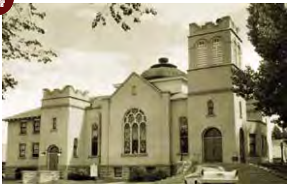
METHODIST CHURCH 19 S PARK AVE