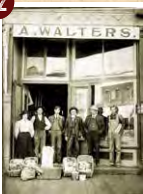
A. WALTERS DRY GOODS 340 E MAIN ST

The original location of the J.W. Page Meat Market, this building, erected in 1893, later housed a barbershop (332 E Main), second hand store (336 E Main), and most famously, the No Delay Cafe & Bar (330 E Main) beginning in 1946.