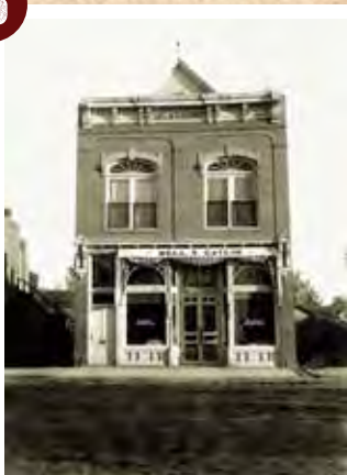
BELL & CATLIN BUILDING 434-436 E MAIN ST