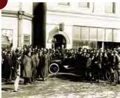
KNIGHTS OF PYTHIAS 33 S CASCADE AVE

Built in 1909, this building functioned as the permanent lodge for the Knights of Pythias fraternal order. Upstairs, the lodge hall housed four large club rooms, used for meetings and community social functions. The main floor housed a variety of businesses, including Hupp Furniture, Safeway, and Mash Appliances.