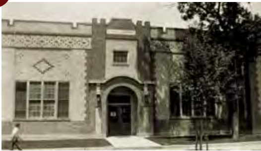
CITY HALL 433 S 1ST ST