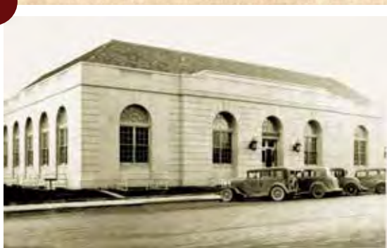
U.S. POST OFFICE 321 S 1ST ST