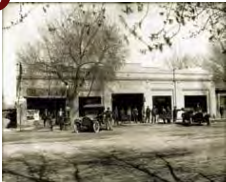
HARTMAN BROTHERS 523 - 531 E MAIN

The Hartman family has been a staple of the Montrose community since its inception. Throughout the years, they have owned a variety of businesses including an automobile repair shop and a sanitarium. The original Hartman Bros. automobile repair shop was built on this site in 1912. The current structure is still owned by the Hartman family and is a remodeled version of the original.