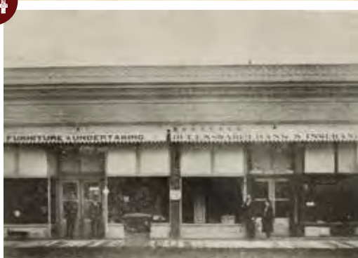
REDDING FURNITURE 324-328 E MAIN ST

Built in 1902, the Redding Furniture store was a prominent Main Street business, selling a variety of home furnishings and decor. The business also ran a mortuary out of this location.