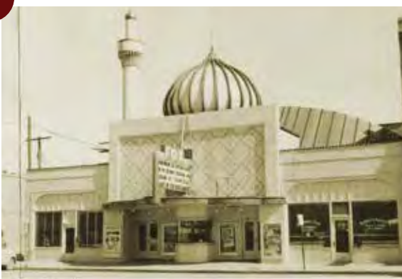
FOX THEATER 27 S CASCADE AVE

A long-time feature of the Montrose downtown, the Fox Theater was completed on October 31, 1929, just two days after the Stock Market crashed. Designed in Moorish Exotic Revival style, the building sought to convey fantasy, as with much 1920s architecture. Throughout the Depression, the theater was a common gathering place with wild gimmicks like pajama contests, pillow fights, vaudeville acts, and "Bank Nights" to help Montroseans escape daily life. Though altered slightly, the theater still maintains its prominent dome and minaret. Step inside and go back in time with the theater's intricate tile work and unique stained glass art.