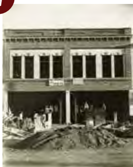
S.H. NYE BUILDING 428 E MAIN ST