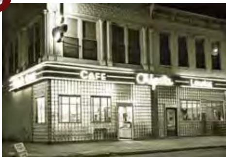
THE THOMAS HOTEL 448 E MAIN ST