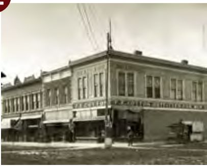
MISSOURI BUILDING 347 E MAIN ST