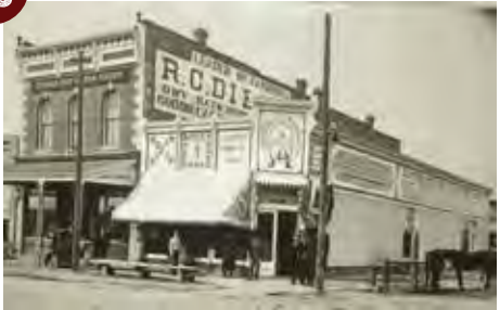
DIEHL'S DRY GOODS 345 E MAIN ST