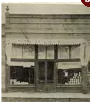
J.W. PAGE MEAT MARKET 330-336 E MAIN ST