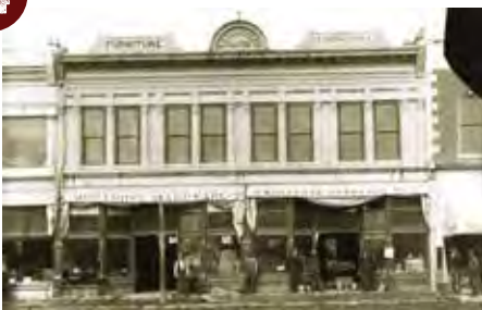
TOWNSEND BUILDING 337 E MAIN ST

T.B. Townsend, a Montrose founder, merchant, and prominent banker, erected this building in 1896 to replace his original adobe hovel store built in 1883, which housed the Montrose Hardware Company and furniture store from 1896-1899. The upper level housed a Green Stamp Redemption Center for many years.